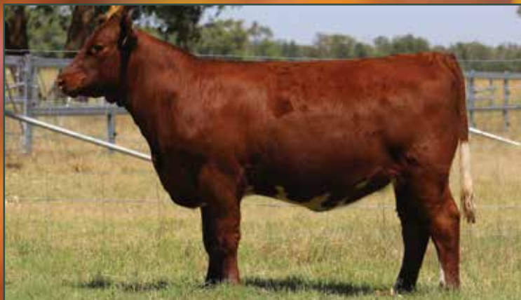
LOT 2 - FUTURITY ROMPERS RUBY V307