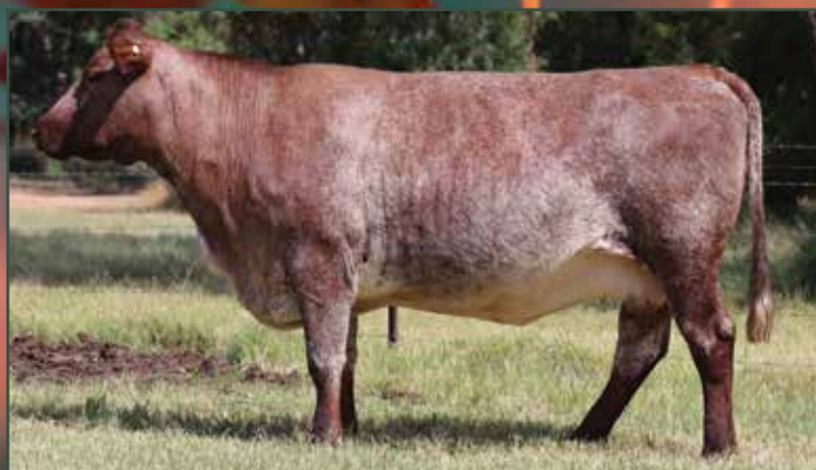
LOT 43 - ANZACS CARNATION P195