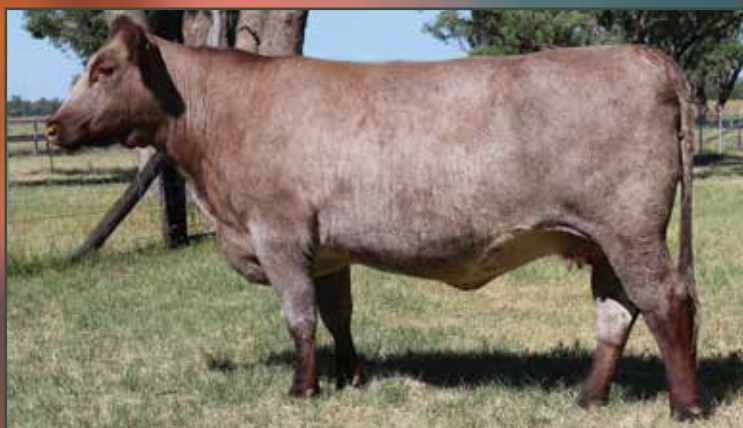
LOT 14 - FUTURITY ANZACS ENIA R10