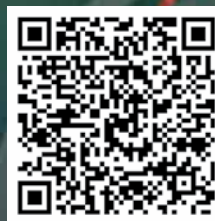
Futurity Video Playlist