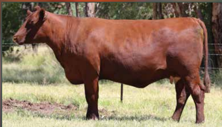
LOT 13 - ANZACS APPROVAL R20