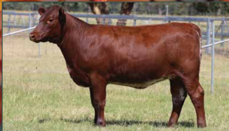
LOT 3 - FUTURITY ROMPERS MELITA V308