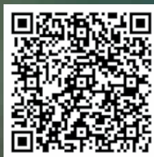
Auctions Plus Catalogue