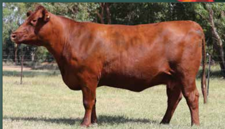
LOT 18 NB MARY ANN R202